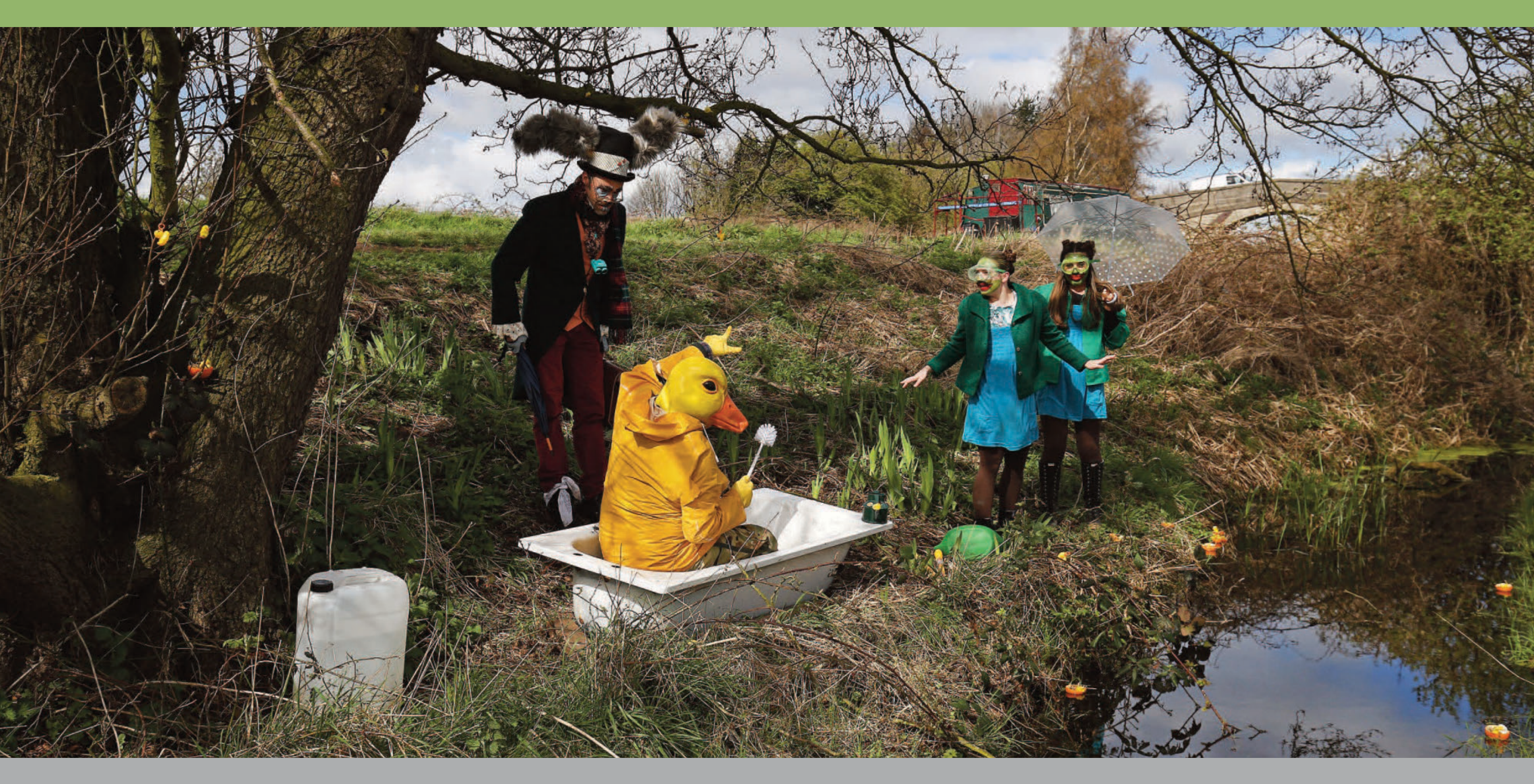
Getting inside the outdoor arts industry with Walk the Plank

Walk The Plank (WTP) is one of the UK's leading outdoor arts organisations, with more than two decades' experience of producing high-quality, internationally-significant events that are seen by millions of people across the globe. A long-term partnership between WTP and Edge Hill University included the development of Sowing Seeds, a live processional piece at Burscough community farm, which encompassed mass movement, music and puppetry. Edge Hill students were trained in outdoor/participation arts practice by experienced lead artists from WTP, while graduate mentees worked in key directorial and production roles. The partnership with WTP aims to enhance Edge Hill's capacity to prepare graduates for employment and provide mutually beneficial activities that serve students' needs as well as those of the outdoor arts sector.